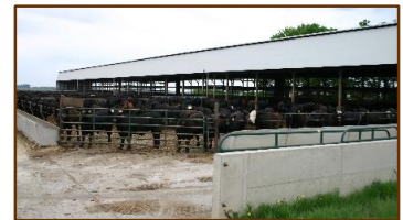
Ridge Roof Open Concrete Lot