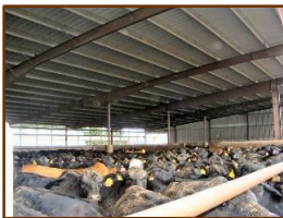
Mono Slope Barn