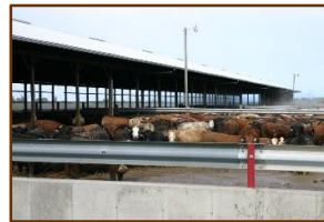
Ridge Roof Open Concrete Lot